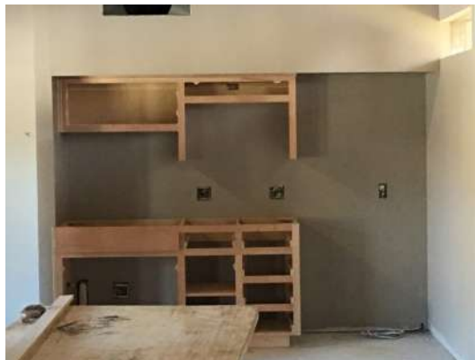
Kitchen Cabinetry going in.

The celebration of the completion will be the Chillin' with Santa Christmas Party on December 10. Makes plans to be there!