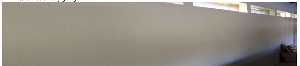
NO MORE cinder block walls.