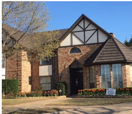
Tulips this bright are usually only found in Holland.