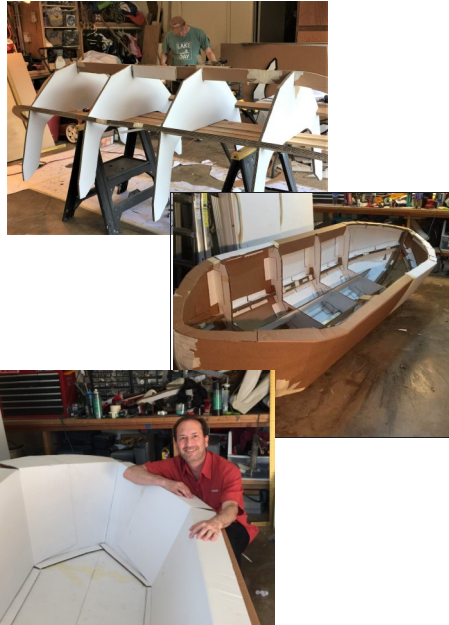
"Cardboard Kicking Aspergers" vessel!